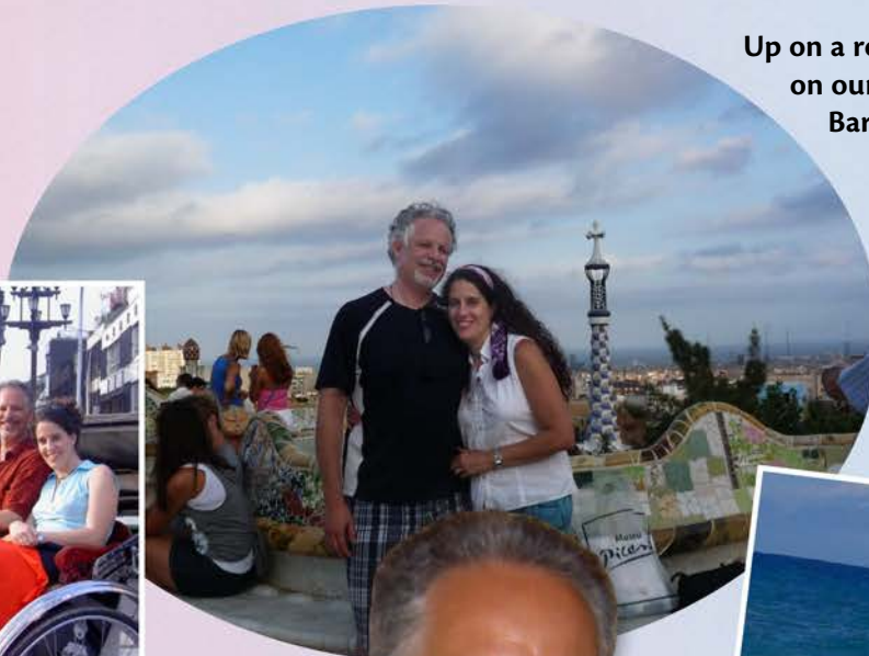
Up on a rooftop terrace on our last day in Barcelona, Spain