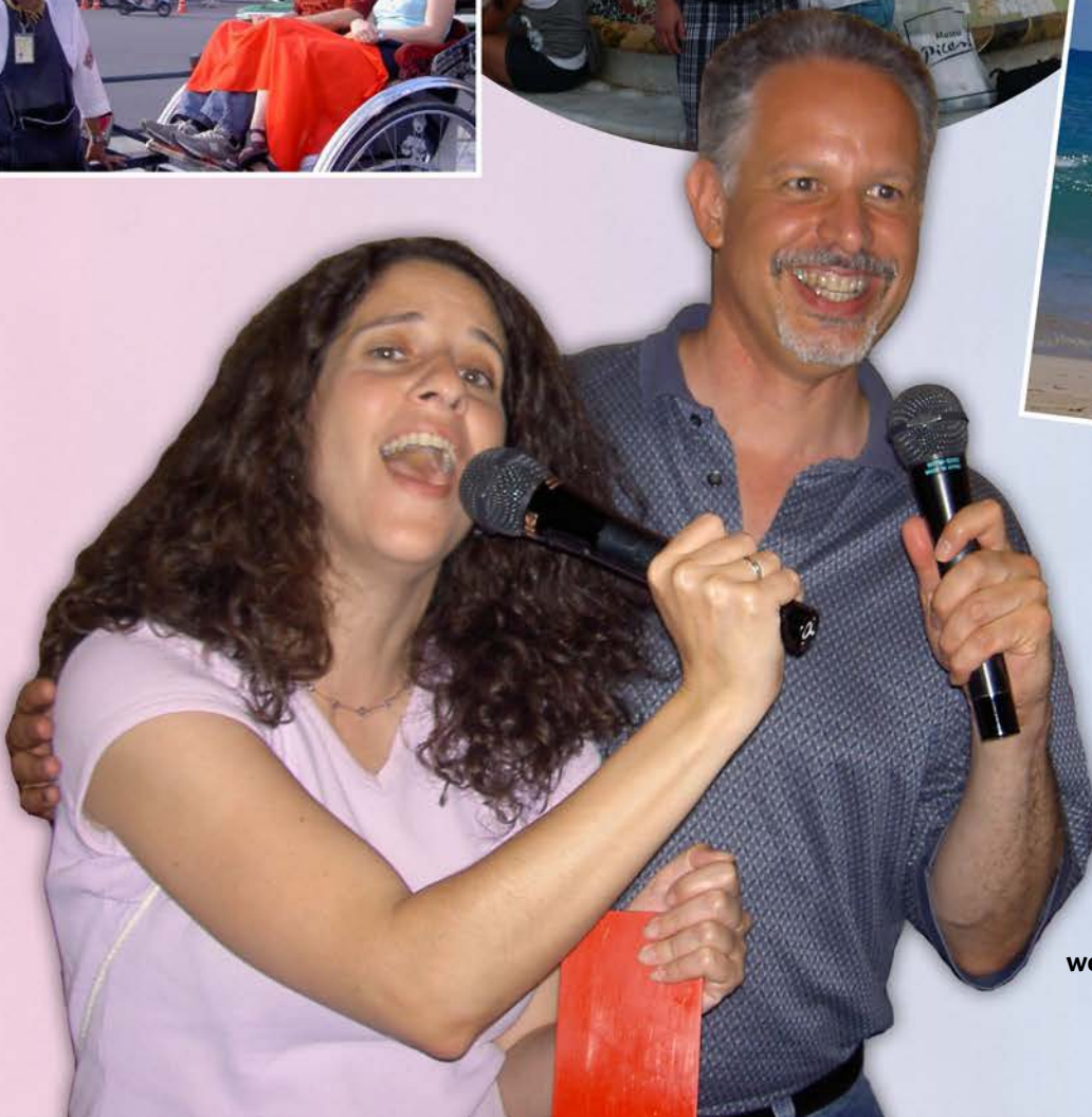
Singing karaoke (not very well, but having a blast!)