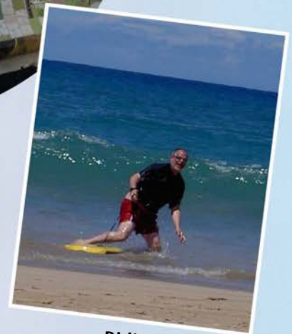
Riding the waves during our Hawaiian honeymoon—tropical paradise!