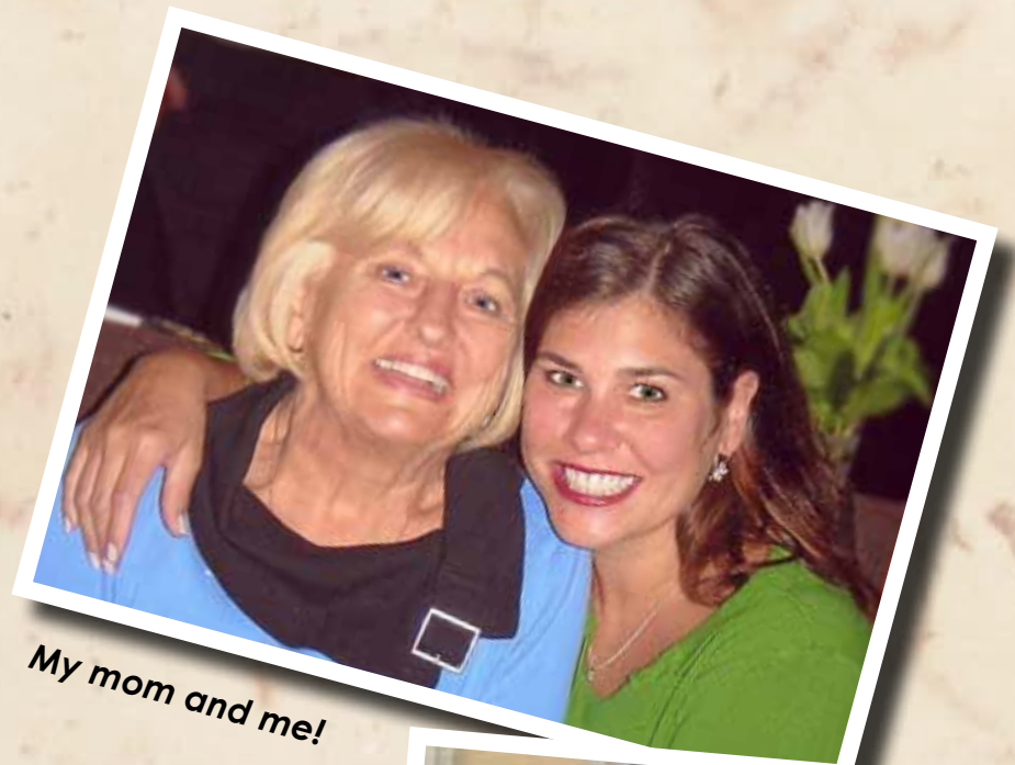
My mom and me!

I have so many great memories of my childhood. I can't wait to create memories with our children!