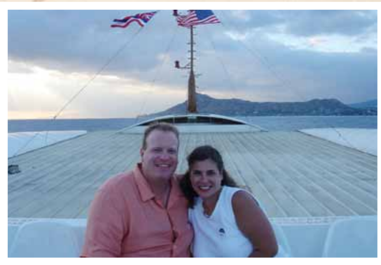
On a cruise off of Diamond Head in Honolulu, Hawaii.

Another special memory I have is going to West Virginia each year. We have a family reunion every year in West Virginia at Pipestem State Park, which is the most beautiful place on earth to me. Family comes from all around the country to vacation there. We play games, swim, go on hikes, play golf and spend a lot of time catching up.