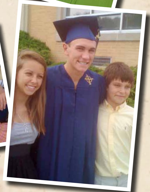
A few of our nieces and nephews!